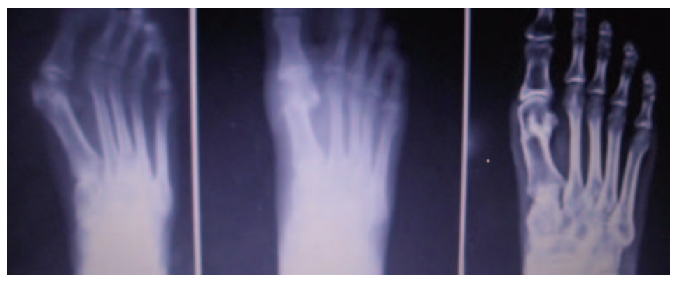
Fig. 5 – X-ray scan of a 53-year-old female patient: left – hallux valgus before surgery; center – postoperative scan of Mitchell osteotomy; right – two years after surgery scan.