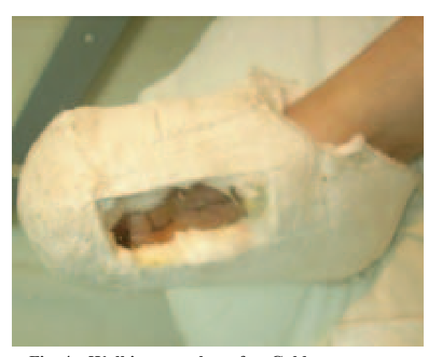
Fig. 4 – Walking cast shoe after Golden osteotomy (postoperative wound check-up).

The number of patients who were operated on was 110, but 12 of them were not part of the study. Furthermore, 5 of those 12 patients did not get regular check-ups, 4 did not wish to join the study and 3 patients were excluded from the study due to the presence of comorbidity (2 patients with rheumatoid arthritis and 1 patient with neuromuscular disorder).