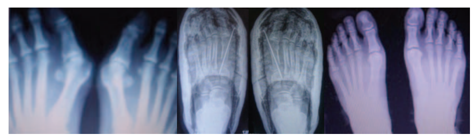
Fig. 6 – X-ray scan of a 49-year-old patient: left – hallux valgus before surgery; center – postoperative scan of Golden osteotomy; right – two years after surgery scan.